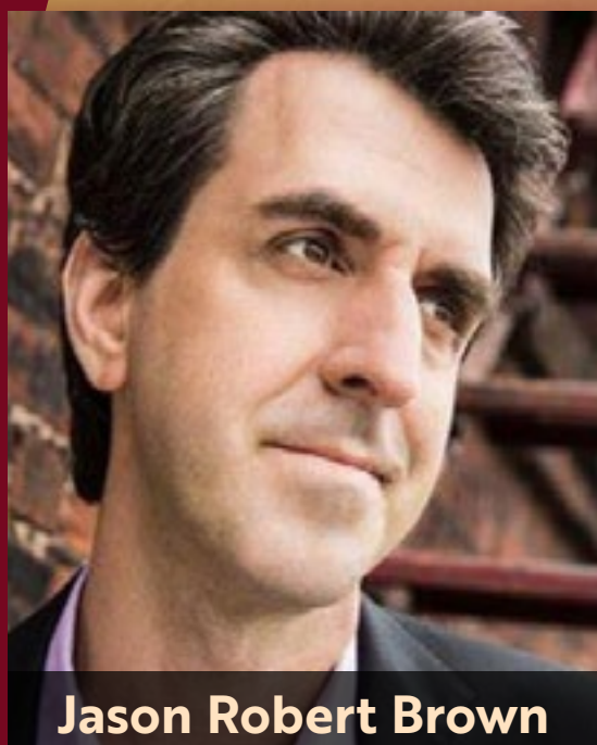
Jason Robert Brown